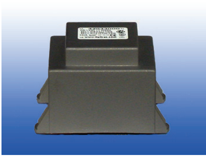
Dimensioni fisiche in mm Physical dimension in mm